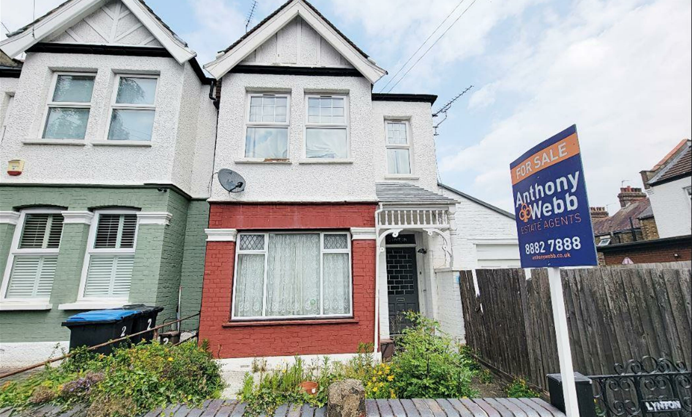
Meadowcroft Road, Palmers Green, London, N13 Chain Free £325,000 Leasehold